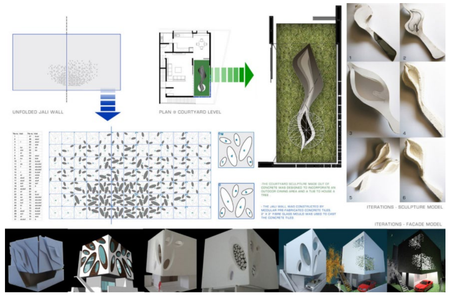
Figure 3: Doloribu sandam vid molupisimi, expe pario esciis.