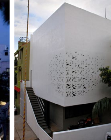
Figure 1: Doloribu sandam vid molupisimi, expe pario esciis.