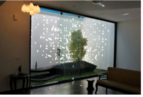
Figure 6: Doloribu sandam vid molupisimi, expe pario esciis.